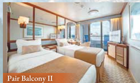
Pair Balcony II