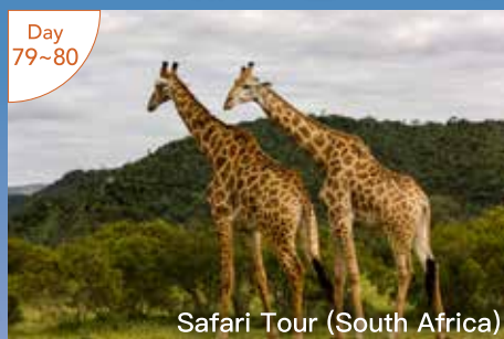
Safari Tour (South Africa)