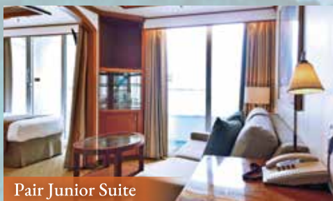
Pair Junior Suite