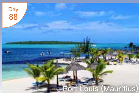
Port Louis (Mauritius)