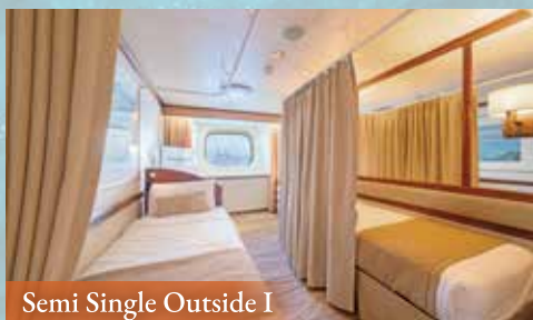
Semi Single Outside I