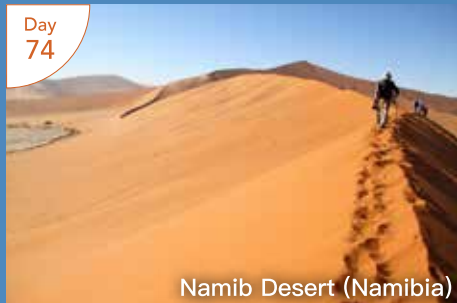
Namib Desert (Namibia)