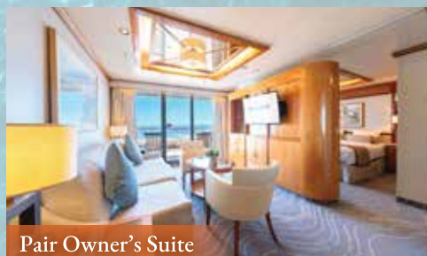
Pair Owner's Suite