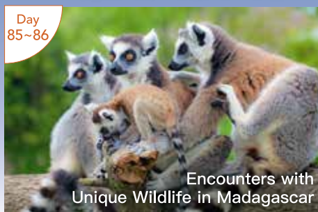
Encounters with Unique Wildlife in Madagascar