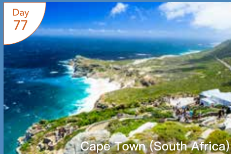
Cape Town (South Africa)